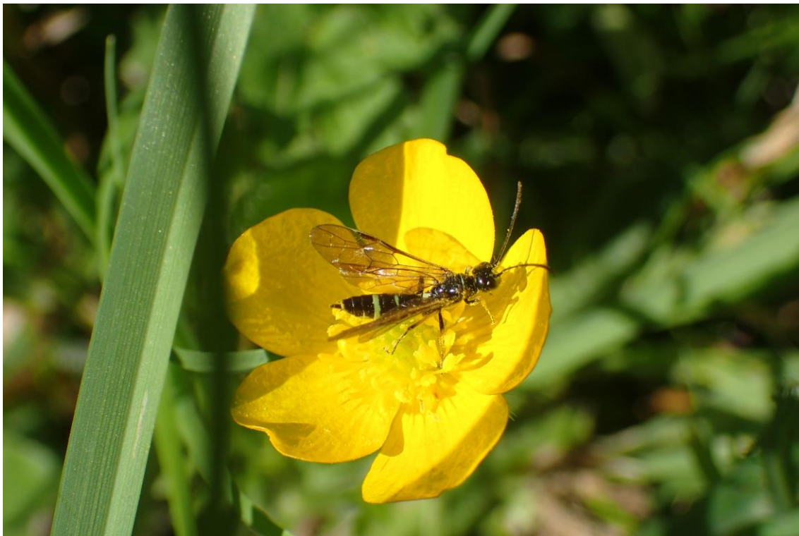
Photo 6 - Cephus sp